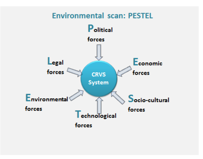
Figure 2: Environmental scan: PESTEL

Analysis of the external environment is about understanding the "big picture" (characterized by forces of change) within which the system operates. Ideally the analysis should take place before the system is established, and should remain a continuous source of planning information. Analysis of the external environment is often undertaken using one of the tools in the PEST toolkit. PEST stands for the political, economic, social and technological forces in the environment. The tool from the PEST toolkit that is recommended for the scan or review of the CRVS system is called PESTEL, which stands for the political, economic, social, technological, environmental and legal forces in the environment (as indicated in figure 2).