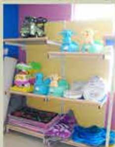
Kids staff Item (10% discount)