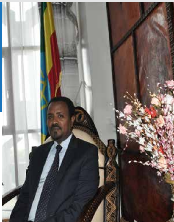
H.E. Diriba Kuma, Mayor of the City of Addis Ababa

Here, it becomes imperative to mention the visionary leadership of the late Prime Minister Meles Zenawi and his