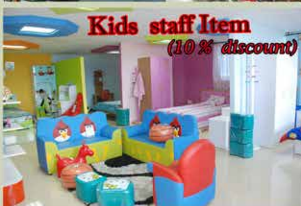
Kids staff Item (10% discount)

10% Discount for UN Staff Union Members on all electronic and children's items at Safeway Lebu branch