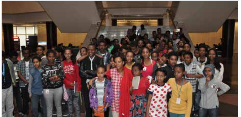
UNCARES-Ethiopia conducts third round of life skills training