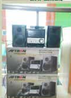
Electronics Item (Aftron brand)