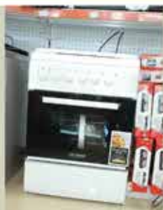
Electronics Item (Aftron brand) (10% discount)

CMC road in front of Civil Service College, Rim Seven Building T: 011-647 98 05, 011-647 95 45, 011-647 92 58 M: 0930 01 25 92/93/94 P: 17334 E: fame@ethionet.et