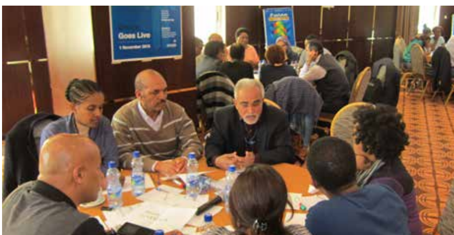
Umoja Deployment Team members preparing for go-live

have been proclaiming the need to work together, and now with the new solution we will be able to actually do it," stresses ECA Chief.