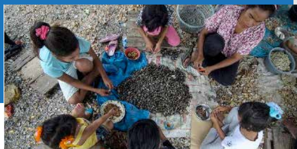
ILO says while many countries are moving towards more fiscal consolidation and less social expenditures, several developing countries are boldly expanding social protection schemes.