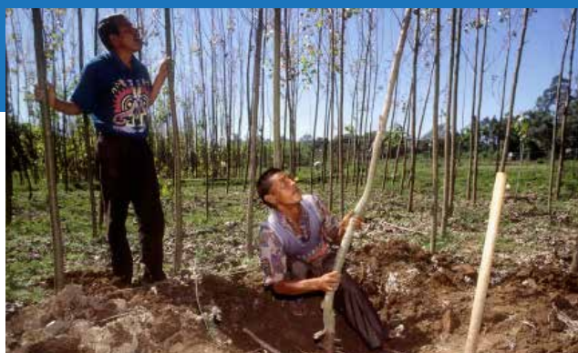
In many rural economies, the forest enterprises of families and communities are major contributors to local livelihoods.

Domestic resource mobilization is central to the agenda and countries agreed to an array of measures aimed at widening the revenue base, improving tax collection, and combatting tax evasion and illicit financial flows. They also reaffirmed their commitment to official development assistance, particularly for the least developed countries, and pledged to increase