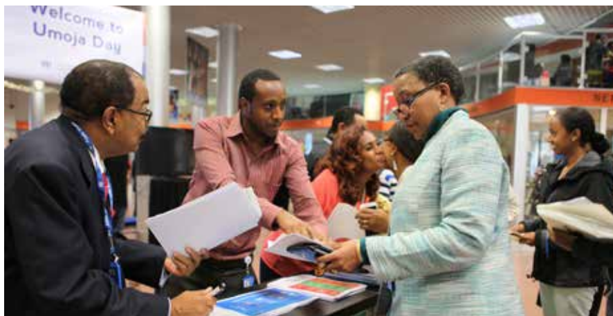
Exchanges during Umoja Day (10 September 2015, at the Rotunda of Africa Hall Building)

Umoja ("unity" in Swahili) will replace cumbersome operations with an efficient, well structured, well organized system. "Umoja is also about the inclusiveness. For many decades we