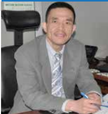
Xiaoning Gong, Chief Economic Statistics and National Accounts Section, African Centre for Statistics

Xiaoning Gong, Chief, Economic Statistics and National Accounts Section, African Centre for Statistics