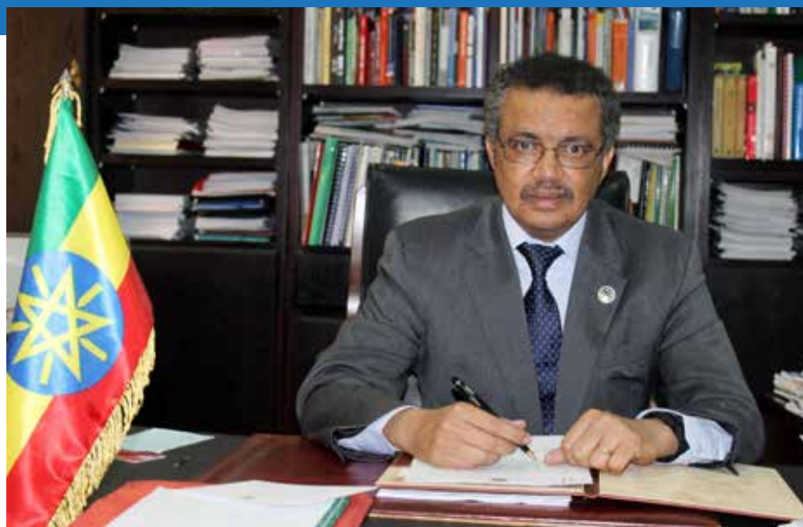
Dr. Tedros Adhanom, Minister of Foreign Affairs

In this connection, I would like to congratulate the UN, its member States and the international community in general for the adoption of the Addis Ababa Action Agenda which laid a global framework for financing development in the post-2015 era. The Third International Conference on Financi-