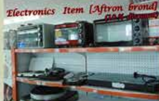
Electronics Item (Aftron brand) (10% discount)