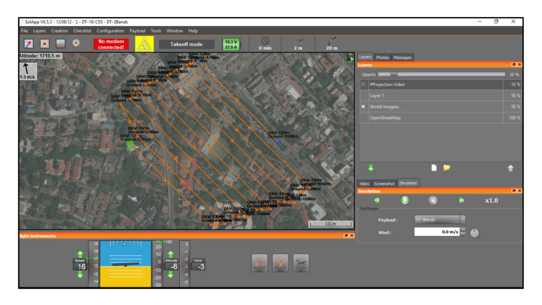
Figure 3: Shows Flight Path in SOLAP Software