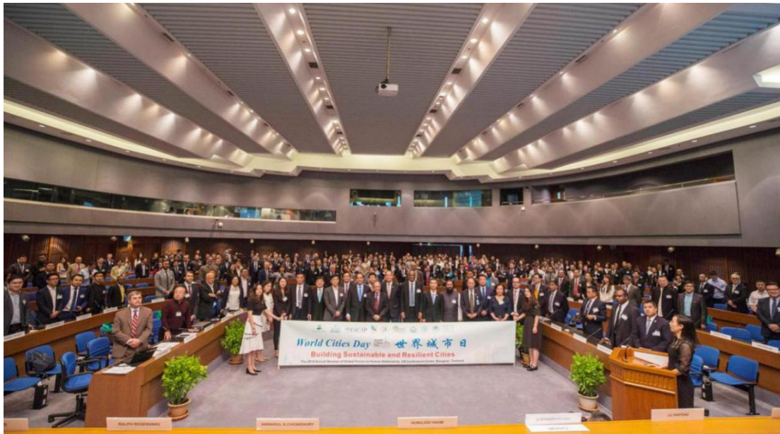
Group photo of participants at the opening session, GFHS 2018, October 30, UNCC in Bangkok