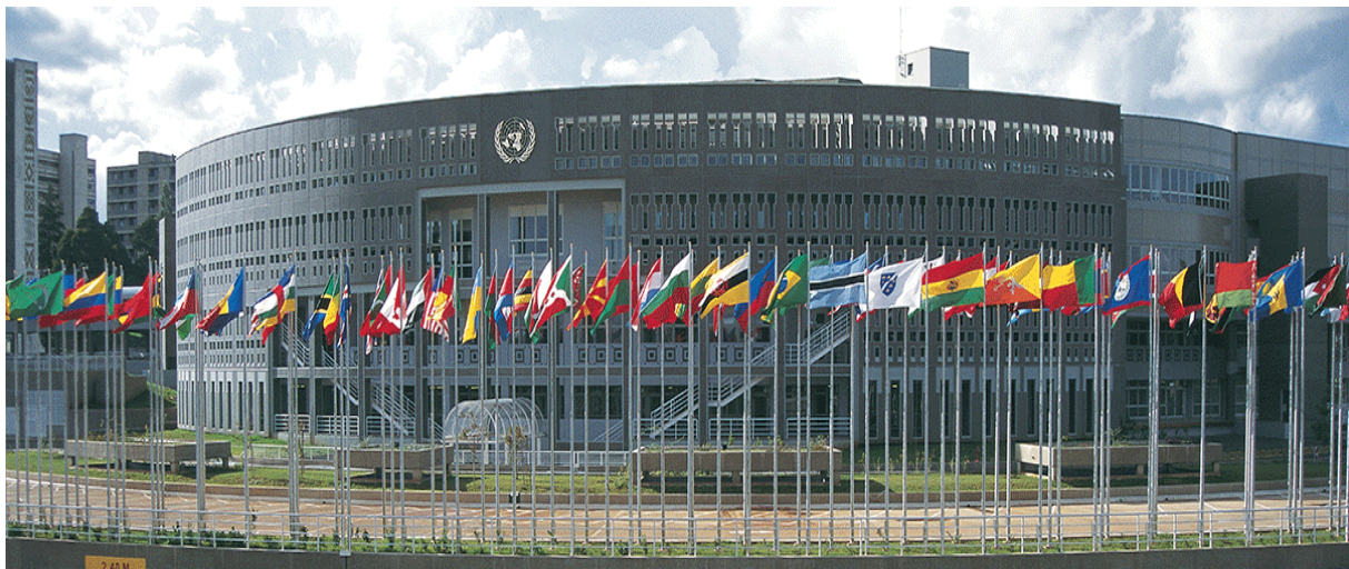
The United Nations Conference Center in Addis Ababa (UNCC-AA)

Against this background, the 14th Global Forum on Human Settlements is scheduled to take place on September 5 th and 6 th , 2019 in the United Nations Conference Center in Addis Ababa (UNCC-AA). Centered around the theme “Sustainable Development of Cities and Human Settlements in the Digital Era”, the Forum will explore in-depth how to harness the huge opportunities arising from the digital revolution, to upgrade the planning, construction and management of cities and human settlements and make them greener, smarter and more sustainable. This would promote enhanced green growth, poverty alleviation, urban resilience, ecosystem conservation, livability and inclusiveness as well as respond more effectively to climate change especially in Africa region, and build stronger, enhanced, and lasting partnerships for sustainability, thereby realizing SDG 11 and the New Urban Agenda. Concerned national dignitaries, senior officials from UN and other international organizations, mayors, heads of multinational corporations, well-known experts and scholars will attend the conference and contribute to its deliberations and outcome.