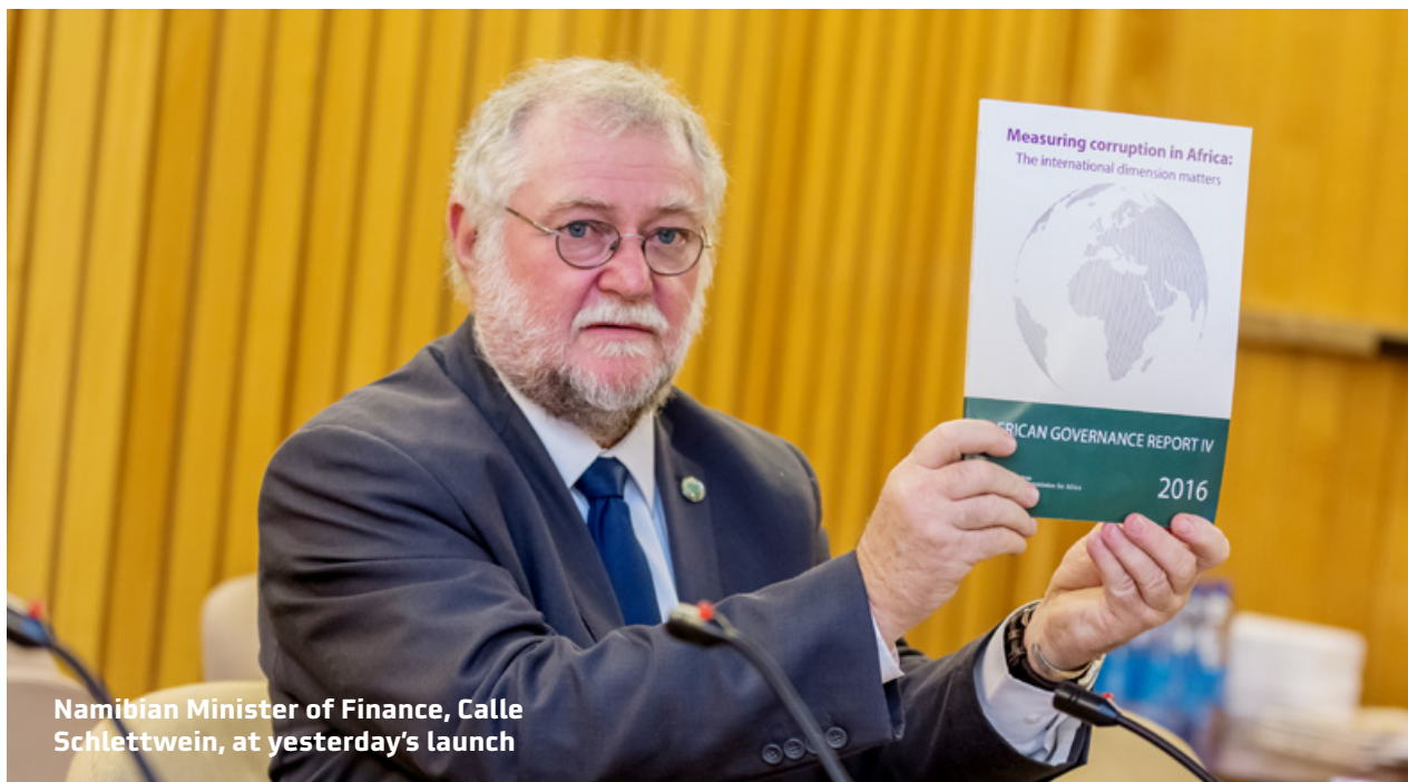
Namibian Minister of Finance, Calle Schlettwein, at yesterday's launch