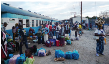
Station scene on Mozambique's Nacala line.

One consequence of this new system is that for the first time in the rail industry, there will be a life-long, unique identifier for each item of rolling stock, issued by the registry and fixed permanently on the asset. This will bring interesting additional industry benefits, facilitating instant asset location tracking as well as helping with insurance issues and accurate maintenance records over the entire asset life.