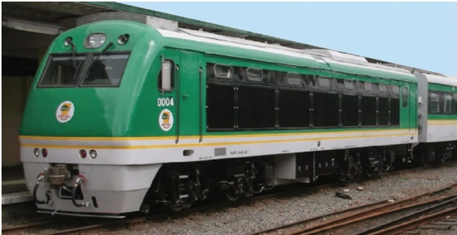
Diesel multiple-unit set in Nigeria.

and financiers will be able to see, in real time, if another party has a claim on the asset about to be purchased or financed.