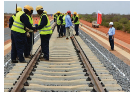
New standard gauge railway under construction in Kenya.

The Luxembourg Rail Protocol was adopted in 2007. The European Union has already ratified the Protocol (in respect of its competences) and a growing number of European countries, as well as countries outside Europe, including South Africa, have either ratified the Protocol or are working towards this. The registry is expected to begin operations in 2017.