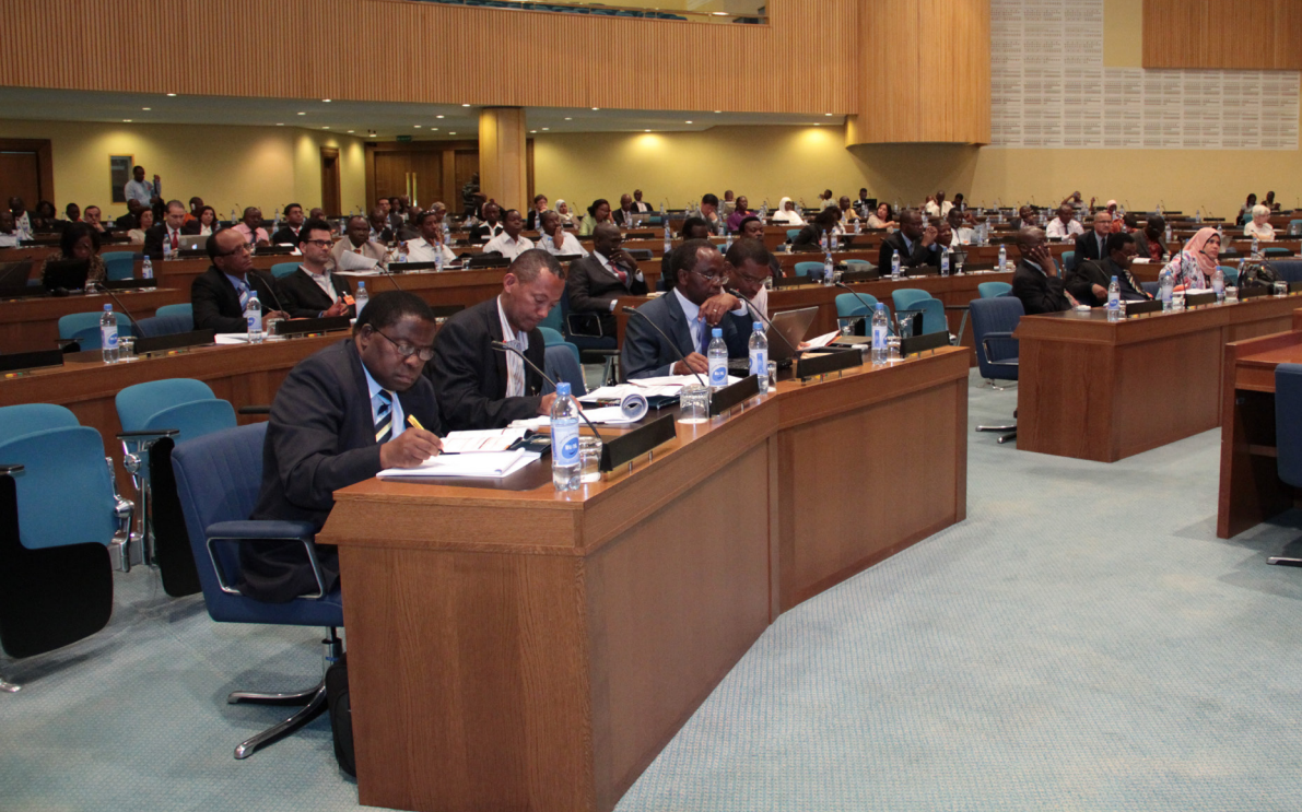
African Economic Conference 2011