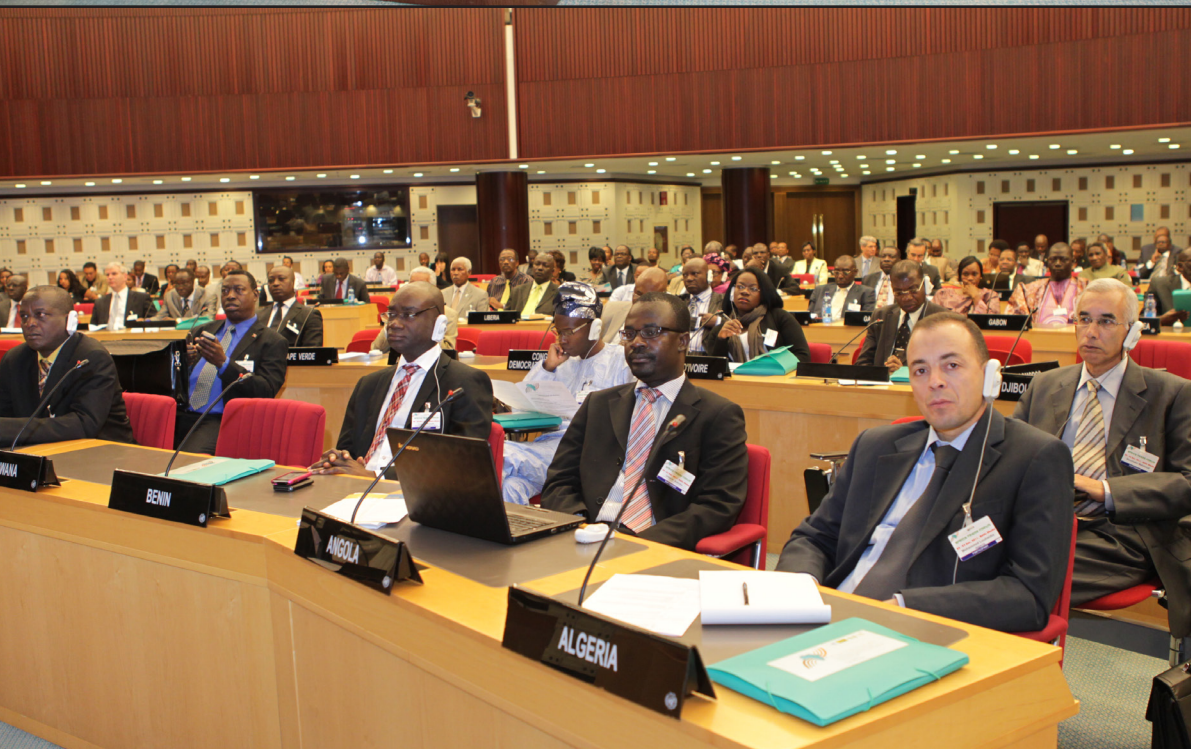
Conference on African Trade Forum