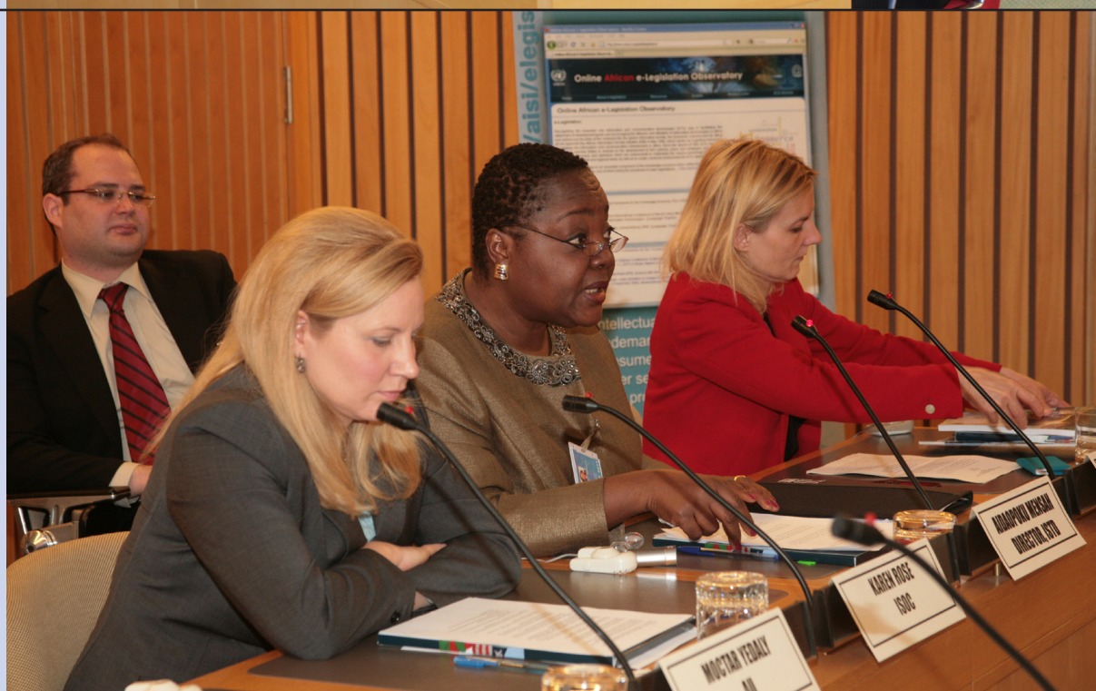
Conference on Development Informa- tion Science and Tech- nology (CODIST)