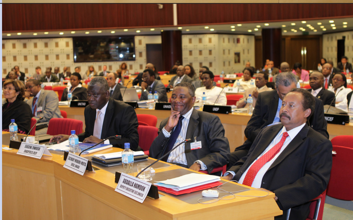
Regional Coordination Mechanism