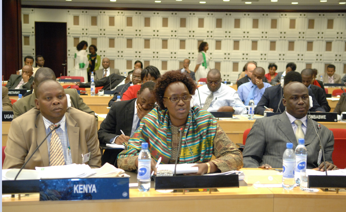
Conference of Ministers 2011