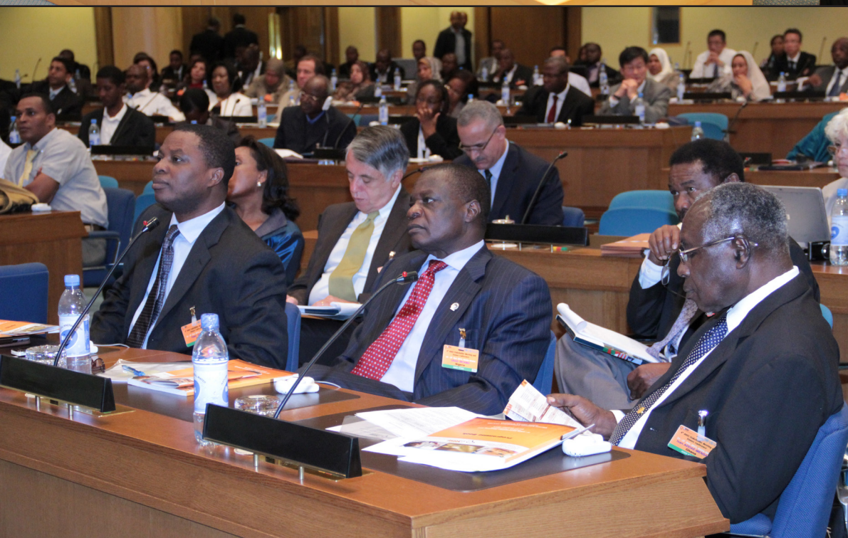
Conference on African Network for Drugs and Innovation (ANDI)