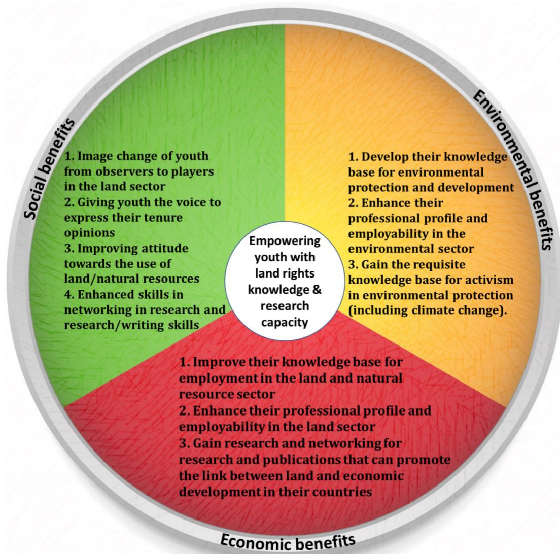
Figure 4: Impacts of strengthening youth's land rights knowledge and research capacity

issues, so many benefits (social, economic and environmental) will be achieved in the regional land sectors.