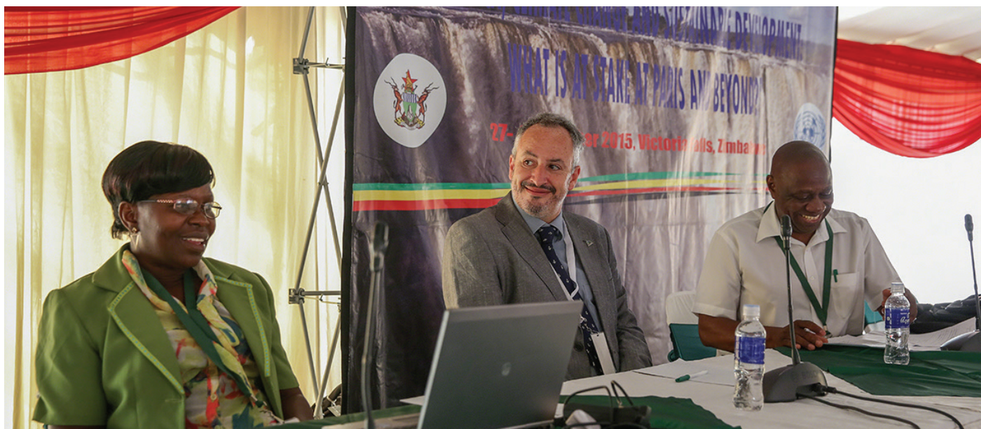
Panelists from the session on 'Climate Change and Food Security'

weather forecasts and agricultural tools; markets; low-cost rainwater harvesting techniques; and drought and flood coping techniques.