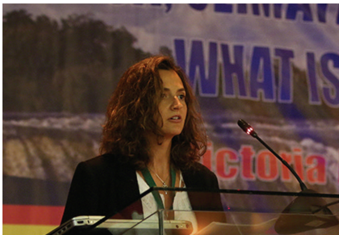
Cristina Vicente-Ruiz, representative of the European Union (EU) delegation to the African Union (AU)