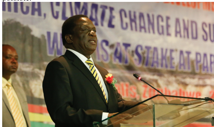
Vice President Emmerson Mnangagwa, Zimbabwe