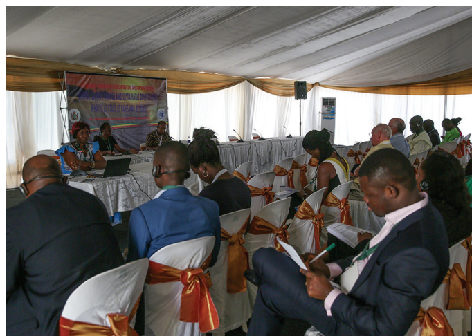
Solutions Forum on 'Agriculture'