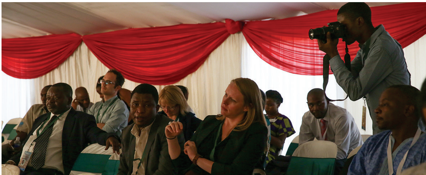
Participants ask questions during the session on 'Mobilizing Domestic Resources for Climate Finance'

increasing stakeholder awareness. He cited financial support, technology, capacity building and political will as key for the implementation of the INDC.