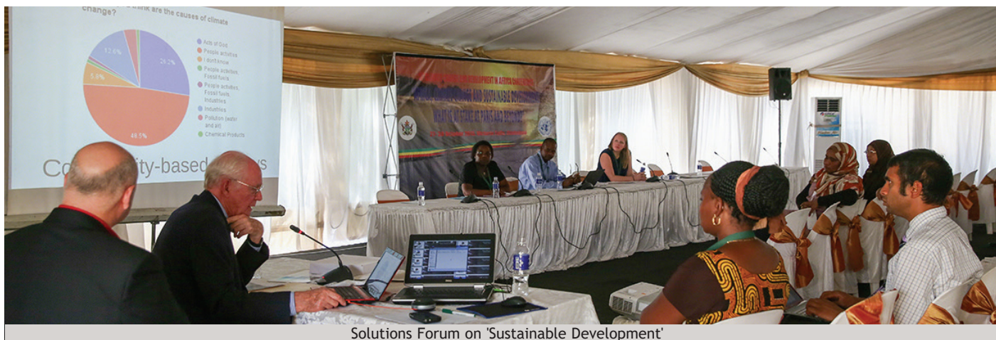
Solutions Forum on 'Sustainable Development'

In the ensuing discussion, participants considered, among other issues: organic farming vis à vis intensification and their climate impacts; how ICTs facilitate access to markets for indigenous communities; local climate indicators that explain climate change; and the findings from age disaggregated data on the perception of ICT use in the dissemination of indigenous knowledge.