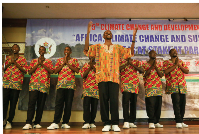
Traditional performers welcome delegates to the 5th Conference on Climate Change and Development in Africa (CCDA-V)

In the same vein, various speakers urged delegates to use CCDA-V as a launching pad to consolidate and refine positions for COP 21. On the interface between climate science and policy in Africa, there were calls to strengthen