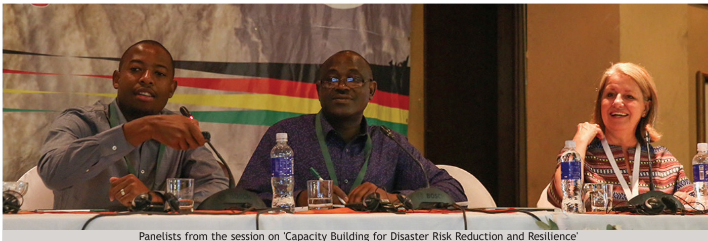
Panelists from the session on 'Capacity Building for Disaster Risk Reduction and Resilience'

In the ensuing discussion, participants highlighted, among other issues: that substantive (or elected) representation does not equate to substantive democracy; the importance of securing property rights and addressing information asymmetries to “realign” accountability at the local level; and ensuring that REDD+ projects provide clear mechanisms for accountability and redress.