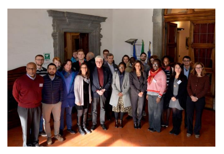
Fig. 1: UBORA Project partners