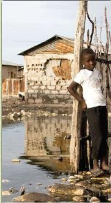
Disaster risk reduction