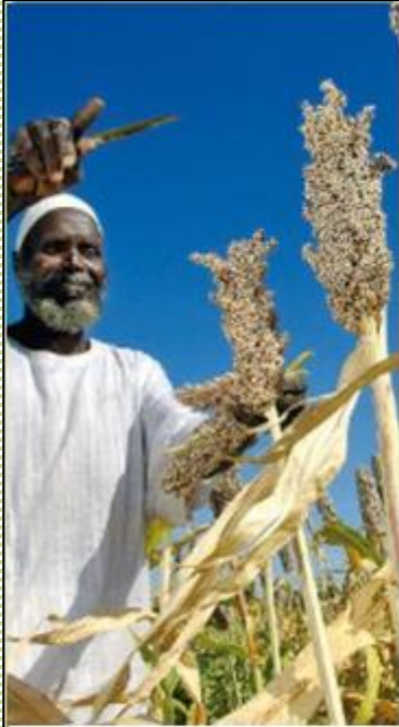
Agriculture and food security