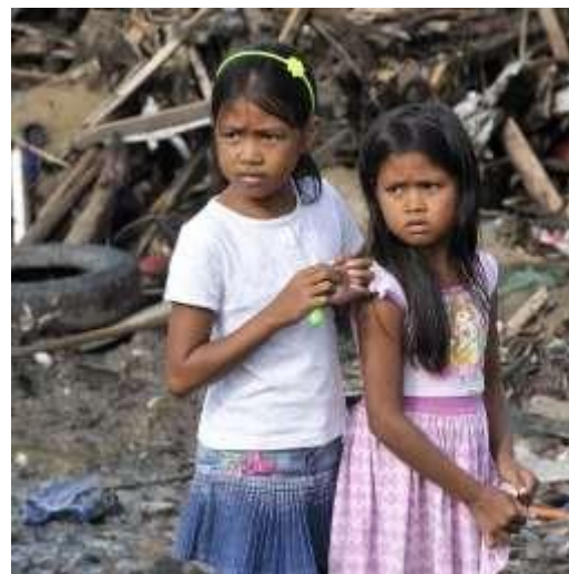
DISASTER RISK REDUCTION