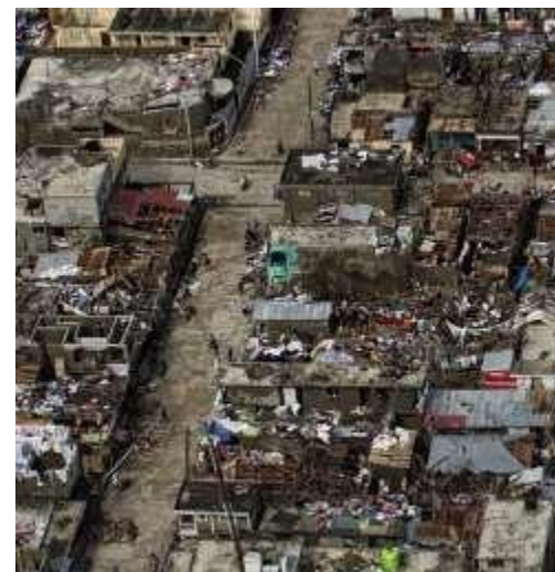
INFRASTRUCTURE AND CONSTRUCTION