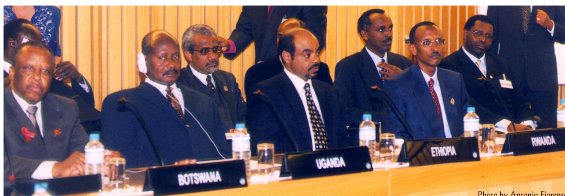
African Heads of State and Government at ADF 2000

If families and communities were the focal points for action on HIV/AIDS, Mr. Kaunda continued, then bureaucracies, procedures and accounting systems must be adjusted so that resources could flow to them quickly. “HIV/AIDS is imposing a new world on us” and systems