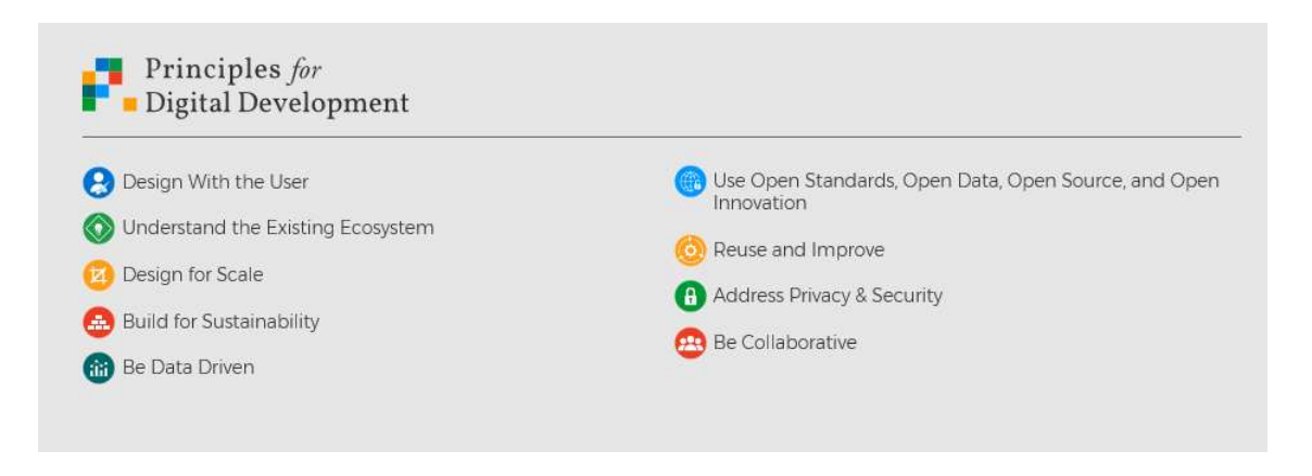
Figure 2 Principles for Digital Development

4. The Nouakchott Declaration from the Fourth Conference of African Ministers Responsible for Civil Registration made multiple references to the need for CRVS digitization: