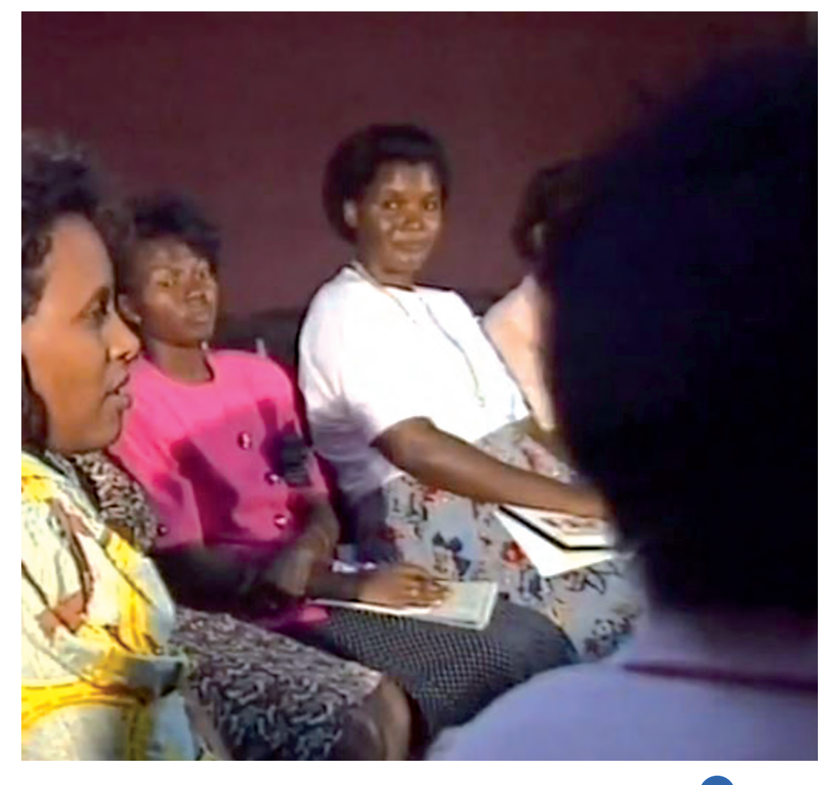
CAFCO women reviewing Resolution 1325

In spite of all these efforts, much still has to be done to achieve women's participation in peace consolidation, particularly in Central Africa. The establishment of a culture of peace requires the mobilisation of all the vital and positive forces (women and men) of society, since there can be no development without peace, and peace cannot be sustainable when it is not sustained by both women and men.