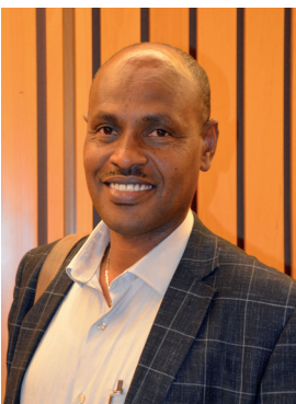
Shiferaw Negash Bira Ministry of Environmental and Climate Change Ethiopia