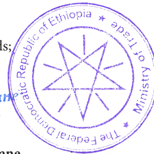
Kebede Chane, Minister of Trade, Federal Democratic Republic of Ethiopia