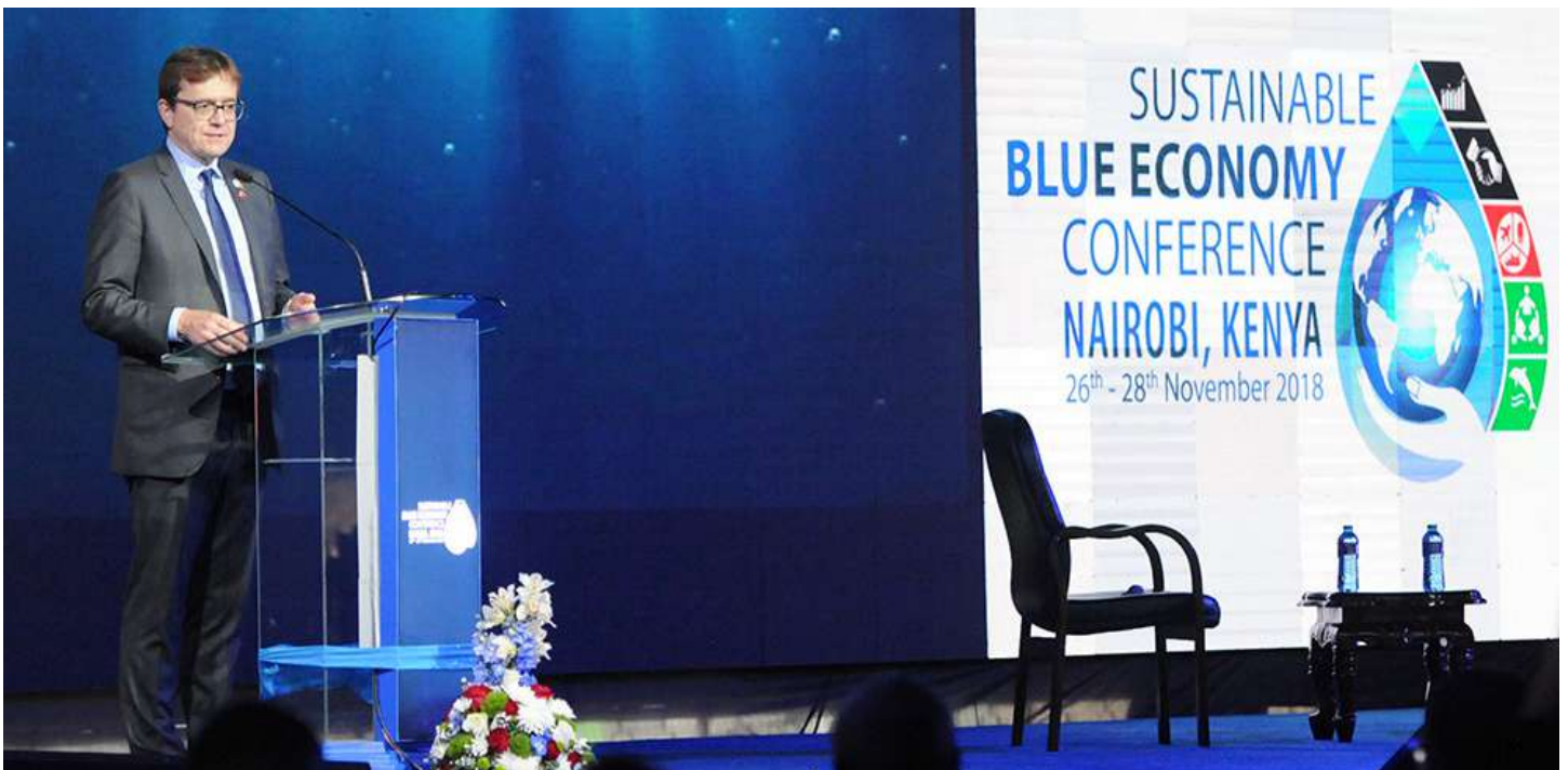
Jonathan Wilkinson, Minister of Fisheries, Oceans and the Canadian Coast Guard, representing Canada, the co-host of the Sustainable Blue Economy Conference