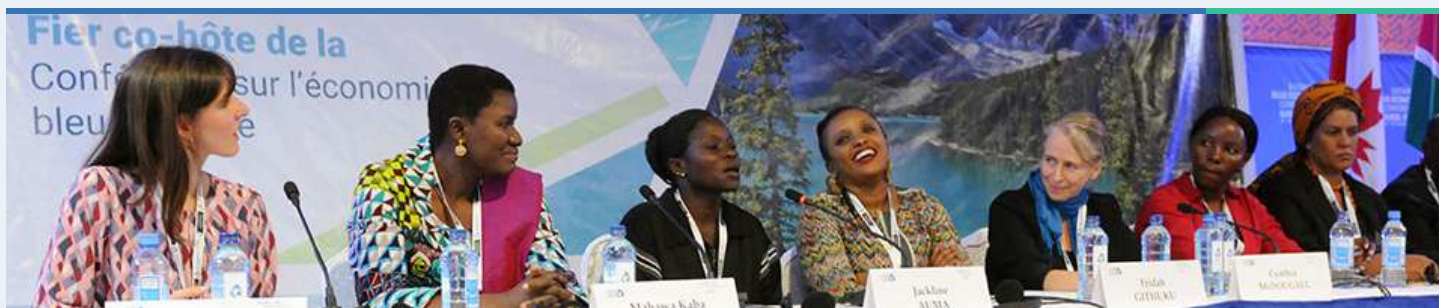
Panel discussion on "Women and the blue economy"