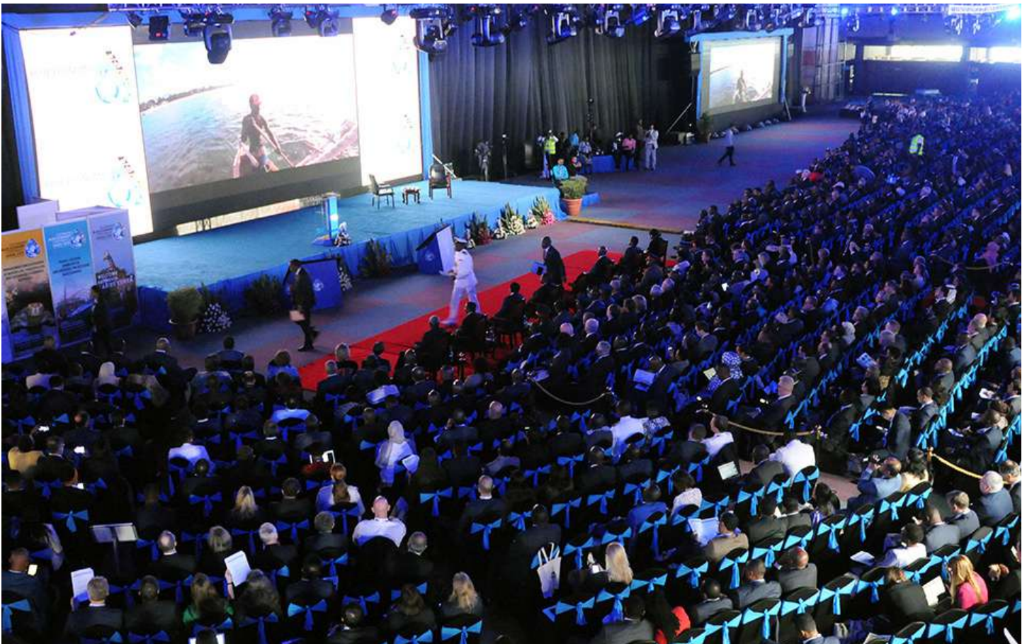
Participants watch a video on the blue economy