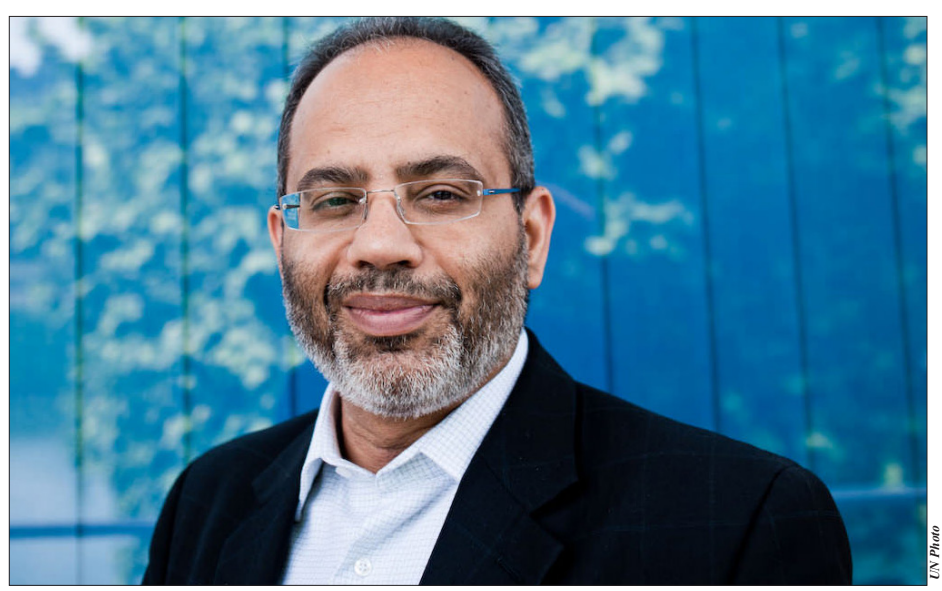
Carlos Lopes, United Nations Under-Secretary-General and Executive Secretary of Economic Commission for Africa

Without sustained multi-stakeholder involvement in decision making, respect for human and property rights, monitoring of the investments as well as accountability and transparency in the land deals, there is the