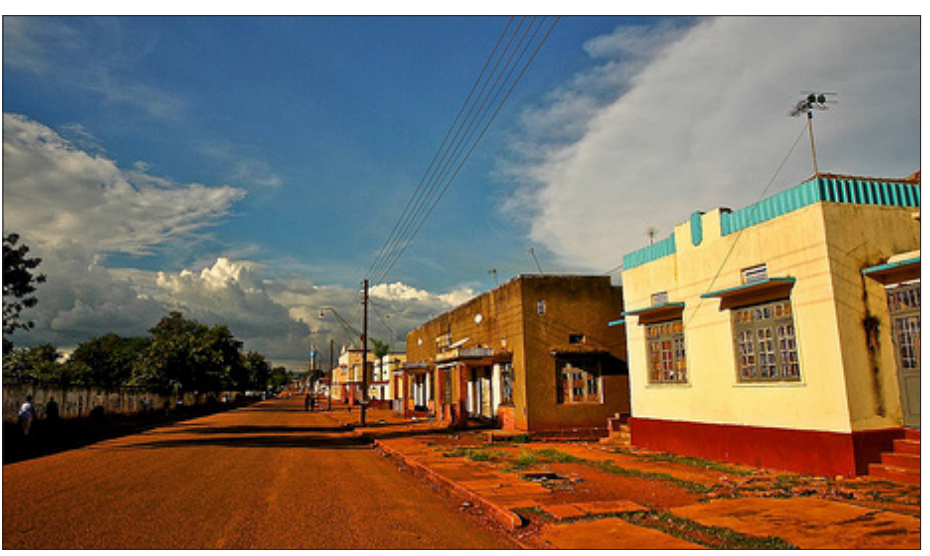
A Jinja from slums to flats is possible.

And although challenges remain, SWID's modus operandi and the successes its women have achieved, has won the respect and collaboration of men, who now agree to the principles of women officially