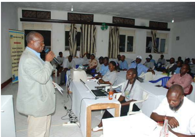
Dr. Muwanga-Zake, Chairman, Board of Directors of UBOS addressing participants at the symposium

Having conducted the last recognized Census of Agriculture in 1963-65, the support by government to fund the Agricultural Census in 2008 was a turning point in generating benchmark agricultural data. While Africa was celebrating the statistics day, Uganda felt that the celebration should reflect the statistical breakthrough for generating the critically needed data on agriculture. The celebrations were held in one of the most active agricultural districts in the country – Masaka district. Whereas there are many other agricultural districts in the country, Masaka district was selected because it had the highest number of enumeration areas for the Census of Agriculture. Out of about 3600 enumeration areas (EAs) in a country with 80 districts, 69 EAs were from Masaka district. A series of activities were held in the district including the official launch of the Uganda Census of Agriculture, a charity walk, blood donation in aid of Masaka Referral Hospital, a Media Workshop, a Symposium and a writing competition.