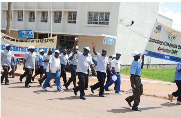
The Chief Walker waving and a cap in the hand

Fertility is one key demographic indicator that tells a lot about the status of women and indeed families in any country. Whereas fertility is a household issue, the maternity wards are a medium for realizing births. The Bureau decided to visit the maternity ward of the referral hospital to understand the conditions therein. This was followed by a charity walk aimed at raising funds for supporting the ward. A match through the streets of Masaka town by the district leadership and staff of Uganda Bureau of Statistics demonstrated the interest Statisticians have not only in measuring fertility but also in understanding the conditions under which women give birth.