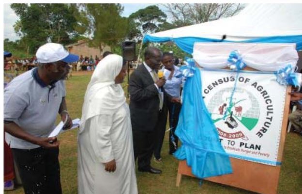
Launch of the Census of Agriculture 2008/09

Bureau of Statistics (in a cap). Indeed this was a great day for the agricultural statistics fraternity in Uganda.