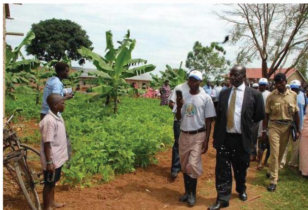
The Rt. Hon Speaker of Uganda Parliament ...

The main celebrations were held in the constituency of the chief guest, the Speaker of Parliament in Kyanamukaaka. Also present at the celebrations was the Minister of State for Planning Hon. Rukia Chekamondo. The main celebrations were well attended by all district leadership in Masaka district. The function which was also