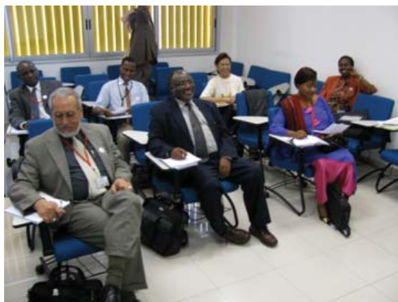
Meeting of the Bureau of StatCom-Africa The picture includes, special guests: Head of NSO of Afghanistan (left) and Cambodia representative back row (right)