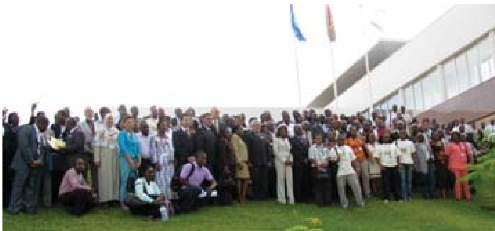
Group picture of ASSD 2009 participants, Luanda, Angola

In conclusion, we thank ECA, AfDB, UNSD and Statistics South Africa for successfully convening the 4th ASSD. We are grateful to the Prime Minister of Angola, The Honourable Mr Antonio Paulo Kassoma, and the Minister of Planning, The Honourable Ms Ana Afonso Dias Lourenço, for gracing the 4th ASSD. We wish also to thank our colleagues at the Instituto Nacional de Estatístico and the people of Angola for their generosity and warm hospitality accorded us during our stay in Luanda. □