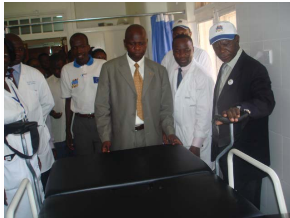
Handing over beds

Involvement of district leadership in statistical activities has a positive impact on the quality of statistics at the local government level. The district leadership preferred to receive maternity beds instead of cash to support the maternity ward. Two maternity beds were later donated to the referral hospital by Uganda Bureau of Statistics on February 27th 2009. The beds were handed over to the representative of the Chief Administrative Officer by the Deputy Executive Director UBOS.