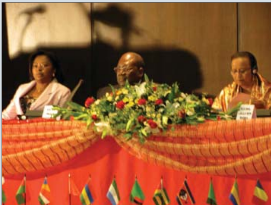
Symposium Africain pour le Développement de la Statistique 2009, Luanda, Angola